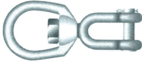
EYE AND JAW